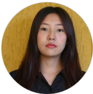
Saymee Subbo Limbo Arvind Fashion