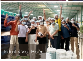
Industry Visit Bisleri