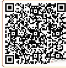
BBA (Business Analytics)