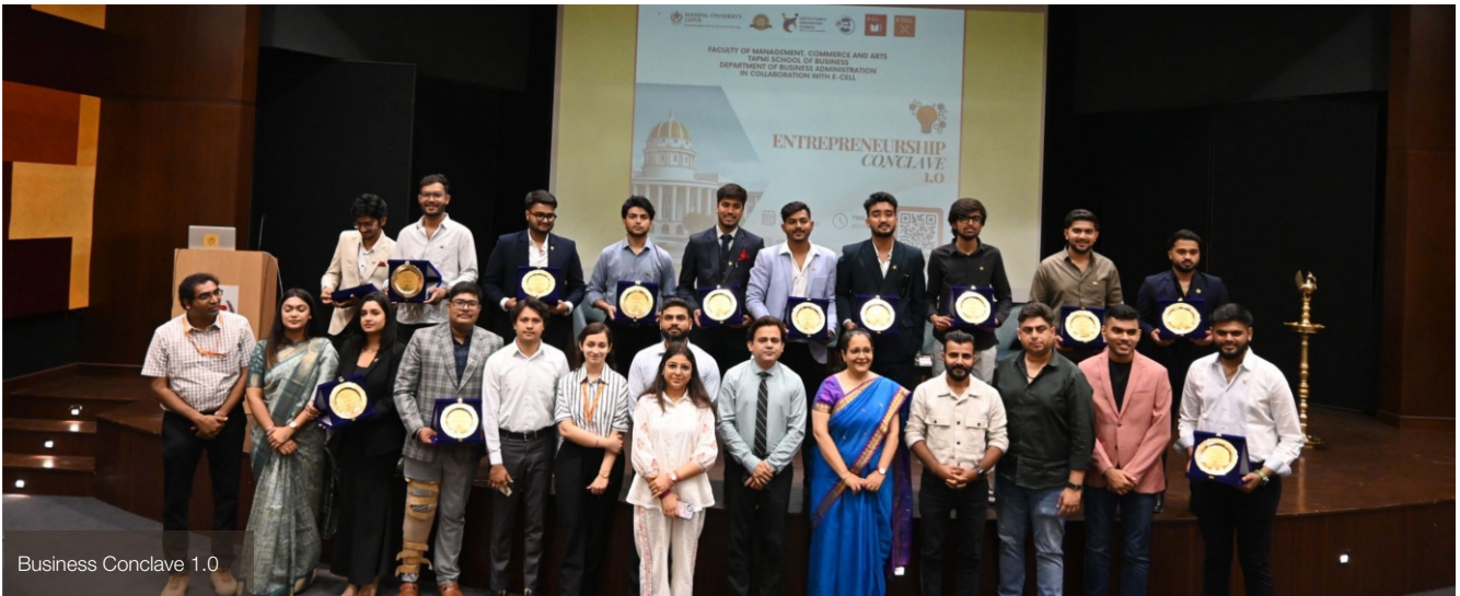
Business Conclave 1.0