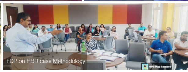
FDP on HBR case Methodology