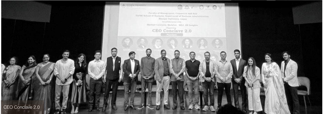
CEO Conclave 2.0